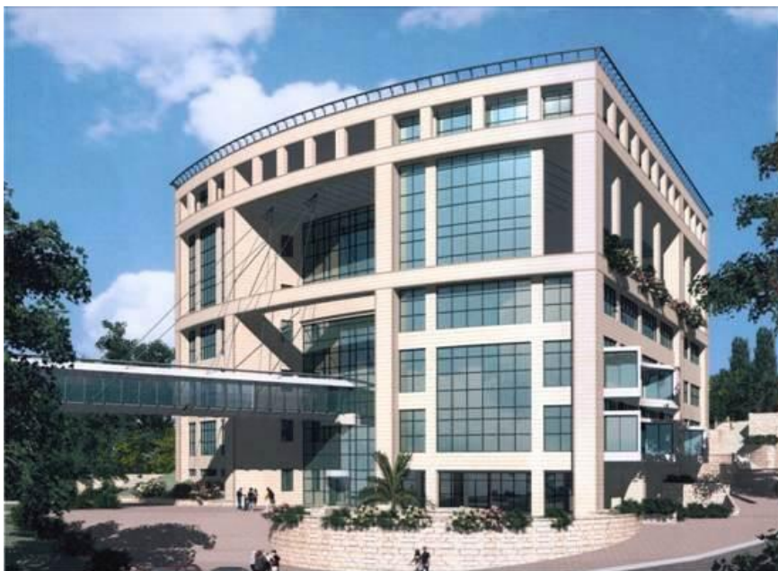
Civil and Environmental Faculty of the Technion